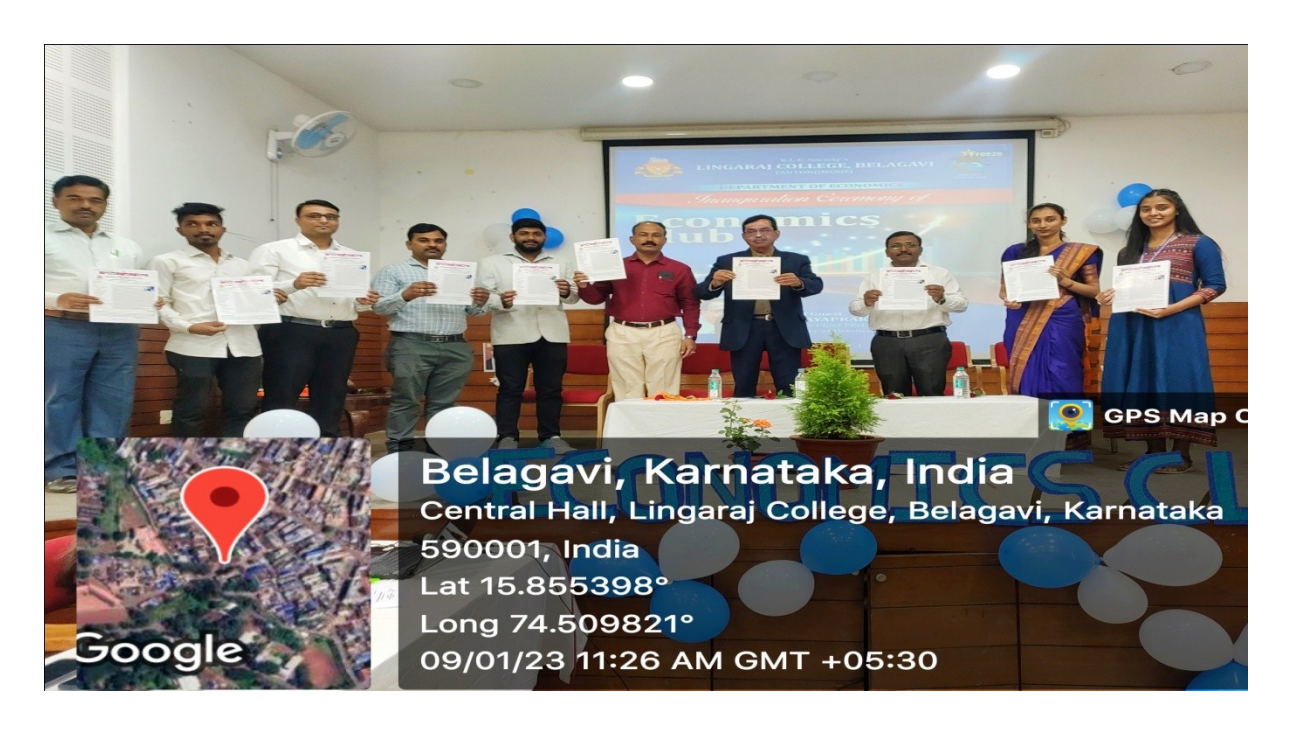
Release of "Arthashastra" Magazine by the dignitaries, staff members and student editors