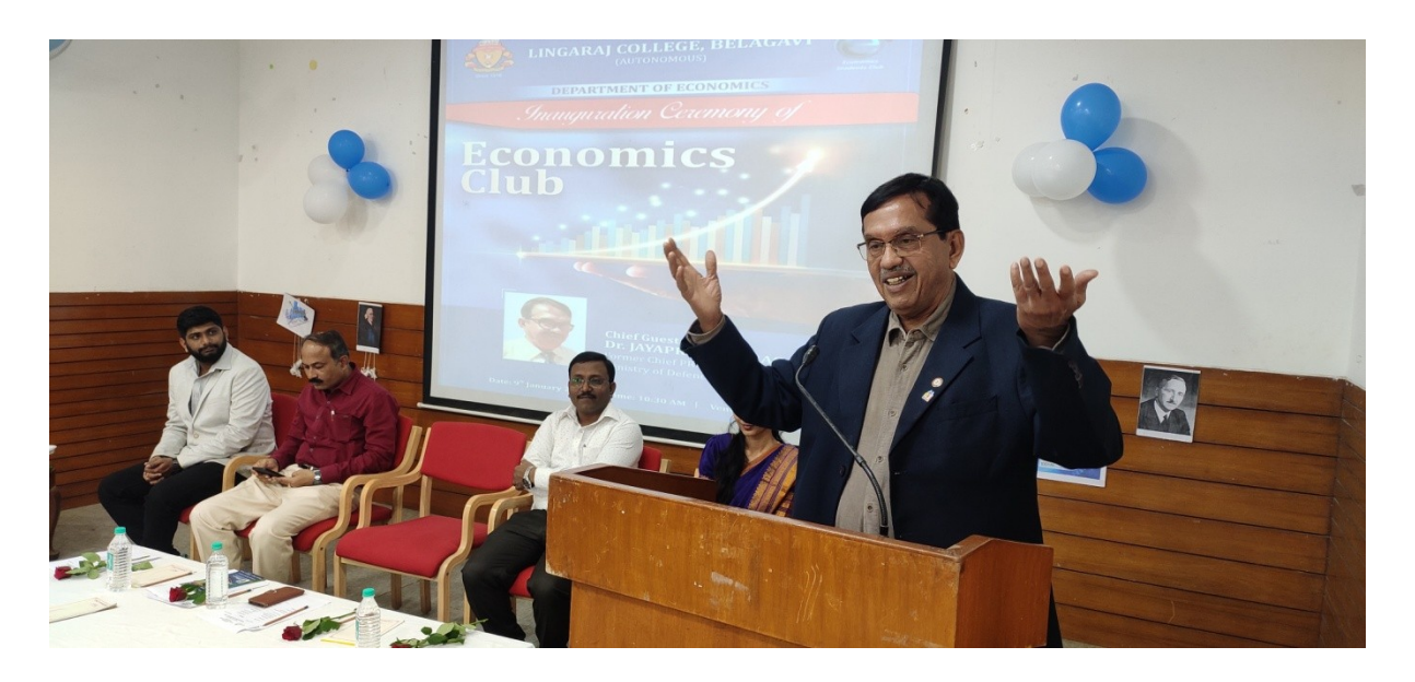
Chief Guest addressing the session